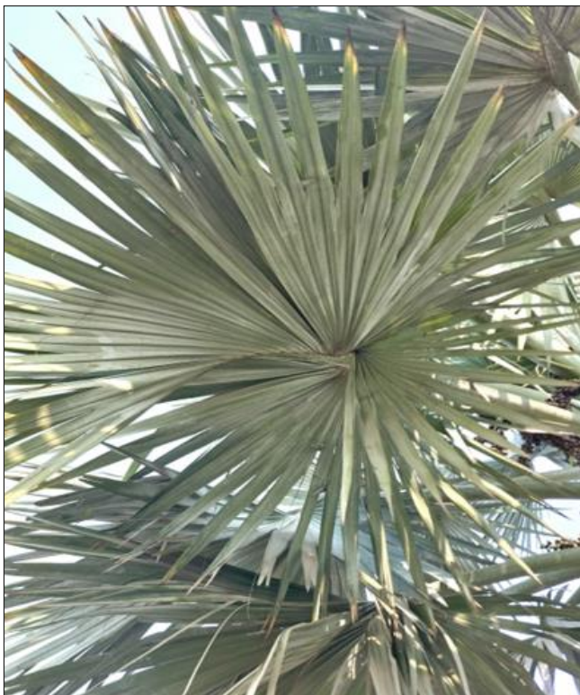
Fig 2: Borassus Flabellifera

These enormous palms have a maximum height of 30 meters (98 feet). The leaves are two to three meters long and fan-shaped. Borassus , which mainly consists of two important species: Borassus aethiopum (African Palmyra Palm), which is widely distributed in Africa, and Borassus flabellifer (Asian Palmyra Palm), which is essential for food and materials in South and Southeast Asia. The most well-known Borassus species are B. flabellifer and B. aethiopum , which are frequently referred to as sugar palms or fan palms. Other lesser-known species include B. akeassii , B. heineanus , and B. madagascariensis .