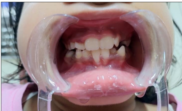
Fig 2: Intraoral examination showing displaced maxillary right central incisor