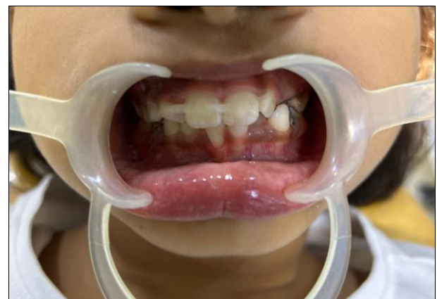
Fig 5: Follow up after 1 week