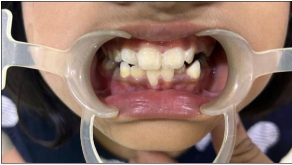
Fig 6: Removal of splints at follow up after 2 weeks