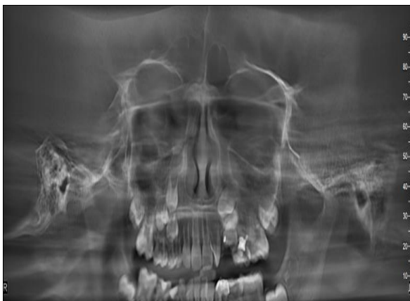
Fig 3: OPG showing cervical fracture with 11