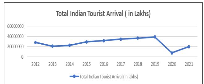
Fig 1: Trends in Indian Tourists Arrivals in Uttarakhand