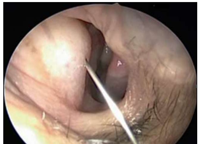
Fig 1: Left nasal cavity, Infiltration of the deviated nasal septum using 1:100,000 adrenaline in saline solution.

At the end of operation, we suture 2 flaps with 4-0 absorbable sutures. Also, if there was any mucosal tear it was sutured with 4-0 absorbable sutures. We restricted septal splinting only to cases in whom a flap tear had occurred. Then both nasal cavities were packed with Vaseline or merocel packs. The time of each operation was calculated, blood loss also was calculated where suction bottle was emptied before operation, accurate calculation of any amount of saline used for washing of operative field during surgery. So, the amount of pure blood loss was the amount in the suction bottle during the whole surgical procedure minus the calculated amount of saline used for irrigation plus the difference in swap weighting pre and post-operative. Postoperatively, all patients were viewed in the outpatient clinic. Once weekly for the 1st month then every 2 weeks for 3 months and monthly till the end of follow up period after 6 months. Statistical analysis of the collected data was done using Statistical package for social science (SPSS). Statistical methods included descriptive method (mean, standard deviation, frequency distributon) and significance tests (t=test) and analysis of variance (ANOVA). The significance will be adjusted when P value equal 0.05 or less.