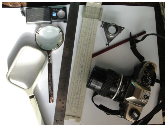
Various tools used in the comparison and analysis of signatures

The photocopied samples of two disputed signatures were taken and marked as D-1 and D-2. One admitted signature was also taken and was marked as A-1. Various tools that were used in decipherment of the forged signatures include hand lens, butter paper, transparency, mathematical tools, markers, scales, pencil, etc.