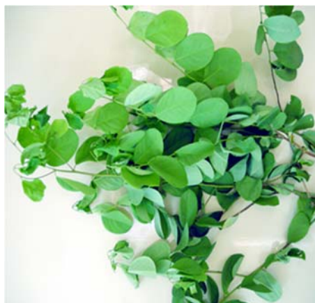
Cleistanthus collinus leaves

This Cleistanthus collinus , a toxic plant, is a commonly available poison especially in South Indian states like Tamilnadu and Pondicherry. Cleistanthus collinus is known by various names in different parts of India viz., Oduvanthalai/Nillipalai in Tamil, Kadiše/Vadisaku in Telugu, Oduku in Malayalam, Karlajuri in Bengali and Garari in the Hindi [1]. This plant poison is also occasionally available in Srilanka, Singapore, Malaysia and South Africa. Cleistanthus collinus belongs to the plant family Euphorbiaceae [4]. Almost all parts of the plant are found to be poisonous. The poisonous product present in this plant is Aryl naphthalene lignan lactones which includes cleistanthin A and B, collinusin and diphyllin [3, 4]. This plant is commonly used as suicidal, homicidal, cattle and fish poison and for procuring criminal abortion [1]. Anticancer potential has also been identified. The toxin inhibits DNA synthesis, induces DNA damage and apoptosis, reduces/inhibits thiol/thiol containing enzymes [5].