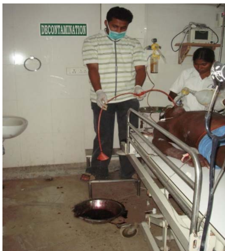
Gastric lavage in ER

As soon as we received the patient in ER, the general protocol for management of poisoning were followed, which includes assessment & establishment of an adequate airway, ensurance of appropriate air exchange, circulatory support, etc. 30 patients were initially managed with gastric lavage followed by activated charcoal with the dose of 1gm / kg and continued with multi-dose activated charcoal 0.5 gm /kg every 6 hour for 48 hrs and the other 24 were not.