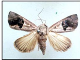
Westermania coelisigna (Walker)