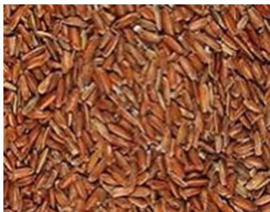
Fig 1: Glutinous black rice

Glutinous black rice varieties ( Oryza Sativa L.) was purchased at plant protection station in the Vinh Hung district, Long An province ; cultivated fields of Long An province in the Mekong Delta, Vietnam [3, 4, 6, 7, 8].