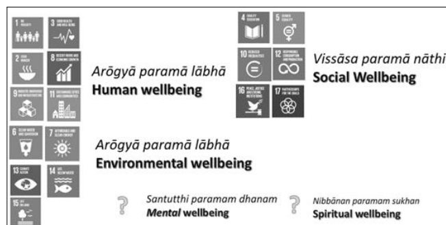
Fig 3: Incorporating SDGs into the new Framework

All the aspects of wellbeing and happiness discussed by different scholars and institutions in relation to the social development can be explained by this framework. Sustainability of the system depends on good practices at individual, community and global levels such as dana , seela , samadhi , utthana viriya , appamada , allenatha , kalyanamittatha , samajeewakatha , subaratha and refraining causes of downfall as mentioned in Parabhawa sutta (samyutta nikāya 1.6) and four sources of destruction as mentioned in Vyagghapajja Sutta (Anguttara Nikāya 8.54).