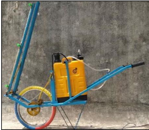
Fig 2: Actual Model