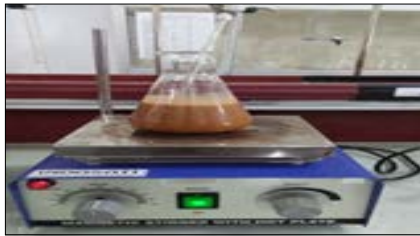
Fig 1: Liquefaction and saccharification of durian shells into flour